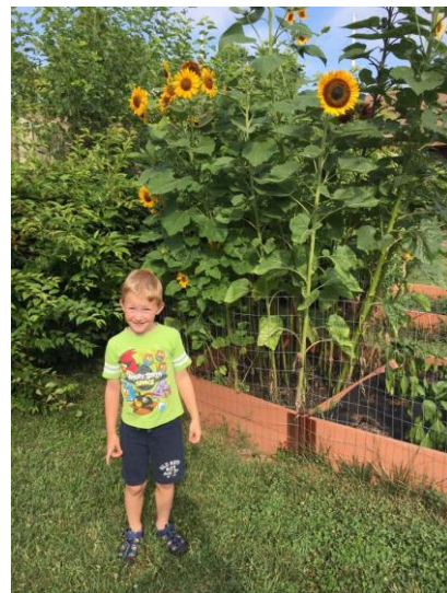
Sunflowers from the Preschool garden

As they venture onto the playground, they will discuss the rules that are important to use in order to be safe getting to the playground and while they are on the playground.